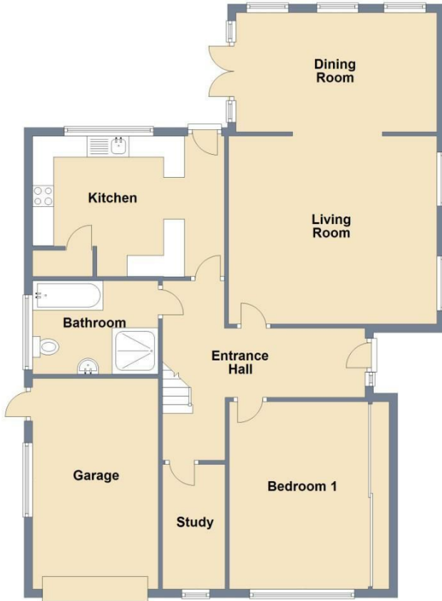
Ground Floor Approx. 109.8 sq. metres (1182.0 sq. feet)